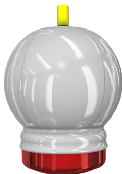
12, 13 lb.