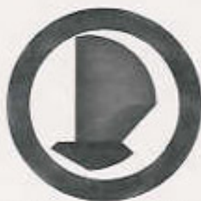
Pearl Reactive Colossus