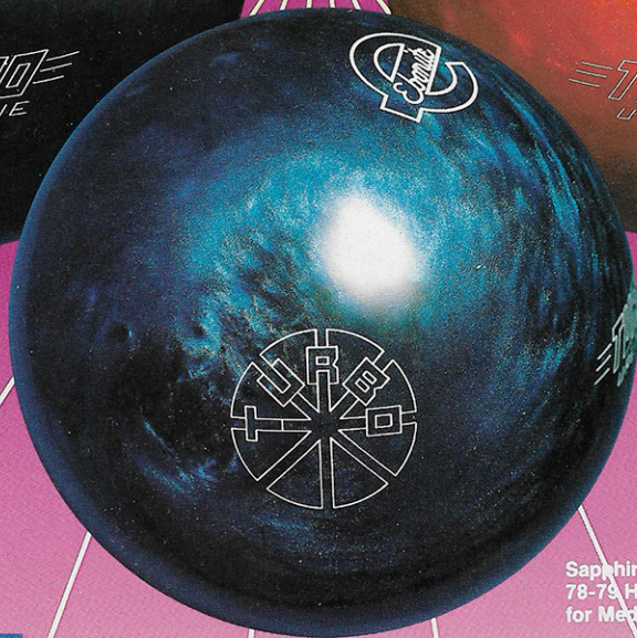
Sapphire 78-79 Hardness for Medium Oil