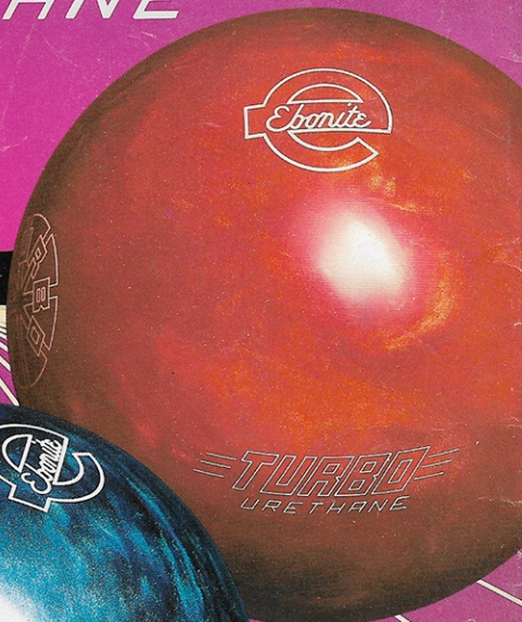
Scarlet 82-83 Hardness for Light Oil