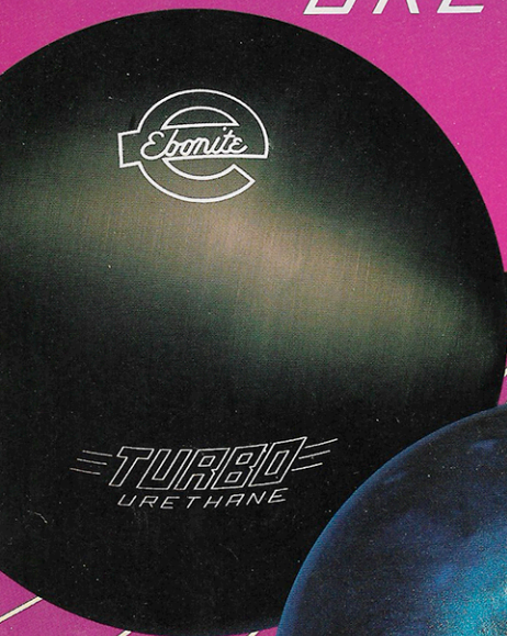
Ebony 75-77 Hardness for Heavy Oil