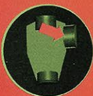
High Torque Core

Add the frightening power of the BOMB to your arsenal. Just visit your local pro shop today.