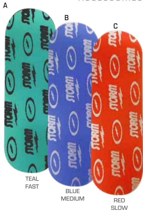
TEAL FAST BLUE MEDIUM RED SLOW

C. THUMB SLOW QTY // SKU 40 Piece Package // AC810S 16 Pack Box // AC810SBX