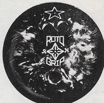
ROTO-GRIP Soft Polyester

Each core is selected by computer, eliminating mathematical guess work. The core is surrounded by high grade rubber then hand polished for maximum tracking characteristics. Thus making the Roto-Star X-2 the best rubber bowling ball for today's league lane conditions .