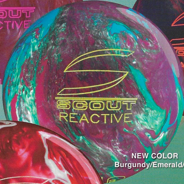
NEW COLOR Burgundy/Emerald/Blue