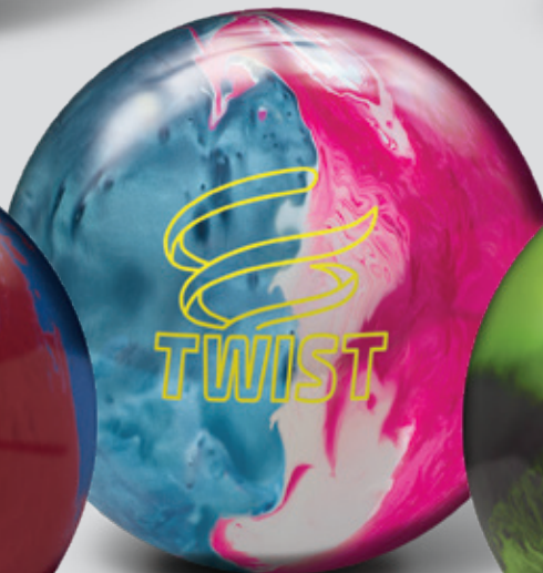
60-106064-93X Sky Blue / Pink / Snow