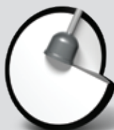
16-14, 12 lbs.

Coverstock Polyester Cover Type Polyester Finish Crown Factory Polish Weights 16-14, 12, 10, 8, 6 lbs. Warranty One year from purchase date