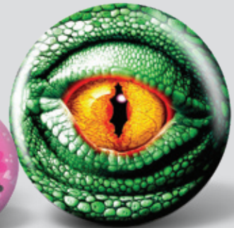
60-400528-93X Lizard Eye