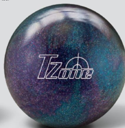
60-105746-93X Deep Space 15-8, 6 lbs.