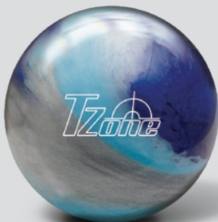
60-105911-93X Arctic Blast 15-8, 6 lbs.