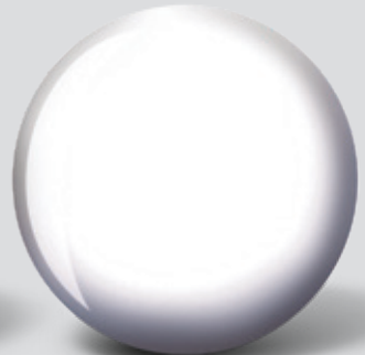
60-104221-93X White Ball