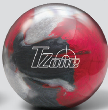
60-105912-93X Scarlet Shadow 15-8, 6 lbs.