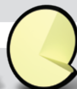
8, 6 lbs.