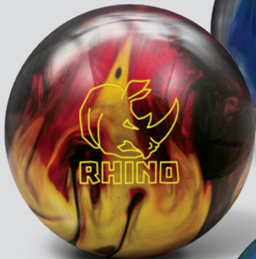
60-105813-93X Red / Black / Gold Pearl