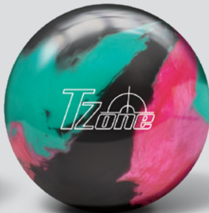
60-106165-93X Razzle Dazzle 15-8, 6 lbs.