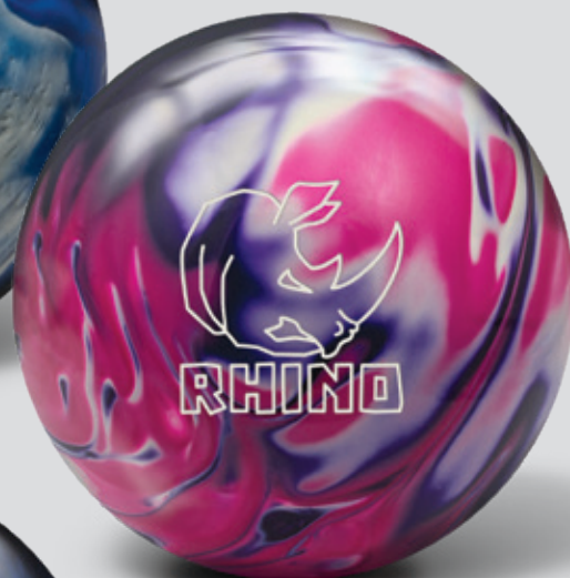
60-105811-93X Purple / Pink / White Pearl