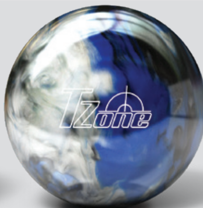
60-105302-93X Indigo Swirl 16-8, 6 lbs.