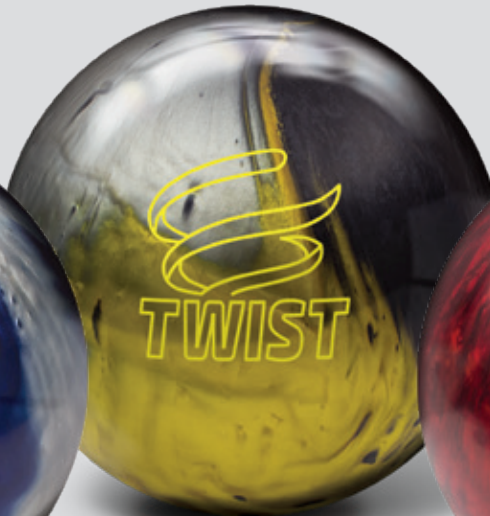
60-106062-93X Black / Gold / Silver