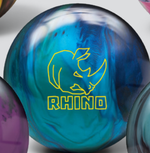
60-106037-93X Cobalt / Aqua / Teal Pearl