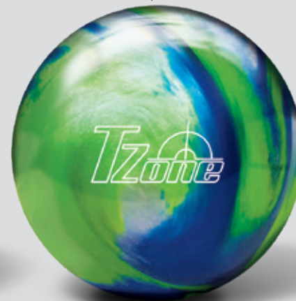
60-106043-93X Ocean Reef 15-8, 6 lbs.