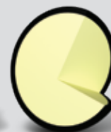
8, 6 lbs.