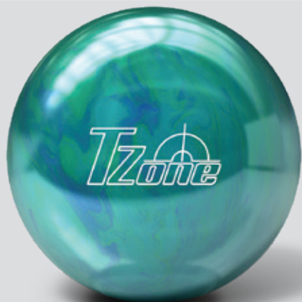
60-105354-93X Caribbean Blue 16-8, 6 lbs.