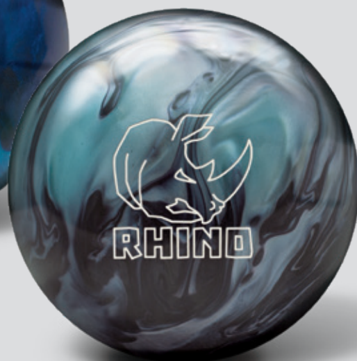
60-106164-93X Metallic Blue / Black