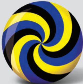
60-400575-93X Spiral Yellow/Blue/Black