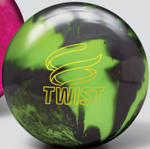
60-106163-93X Neon Green / Black