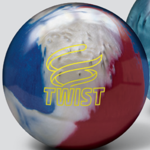
60-106161-93X Red / White / Blue