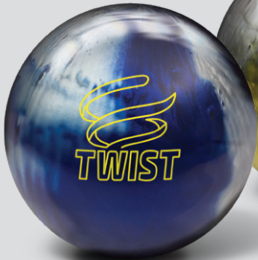
60-106063-93X Blue / Silver