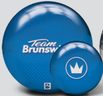
60-400620-93X Team Brunswick