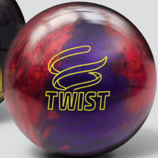
60-106061-93X Red / Purple