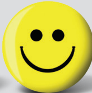
60-400245-93X Smiley Face