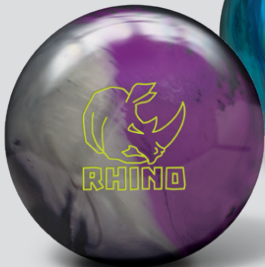
60-106162-93X Charcoal / Silver / Violet