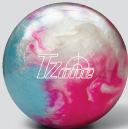
60-106198-93X Frozen Bliss 15-8, 6 lbs.