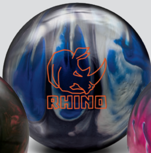
60-105815-93X Black / Blue / Silver Pearl