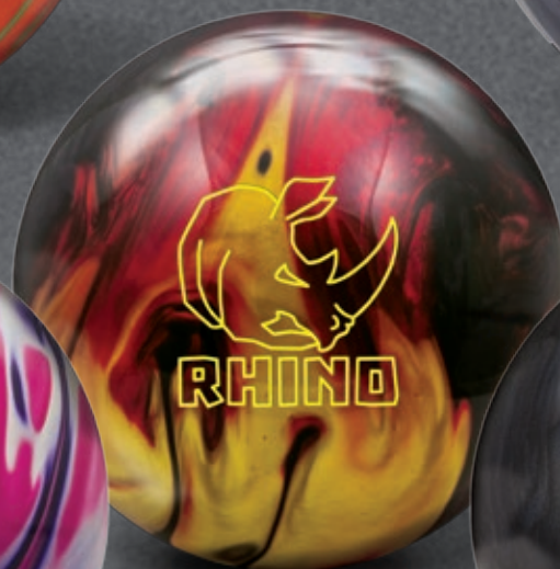
60-105813-93X Red / Black / Gold Pearl