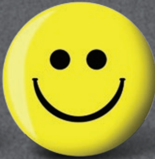
60-400245-93X Smiley Face