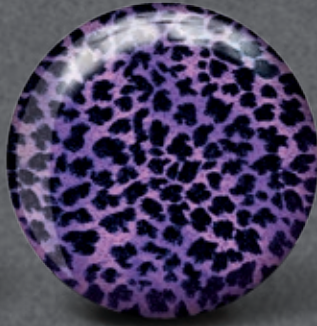
60-400616-93X Purple Cheetah