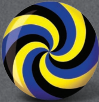
60-400575-93X Spiral Yellow/Blue/Black