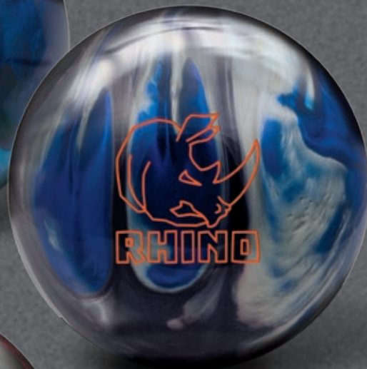
60-105815-93X Black / Blue / Silver Pearl