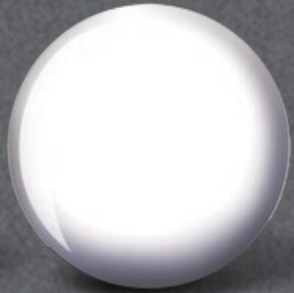
60-104221-93X White Ball