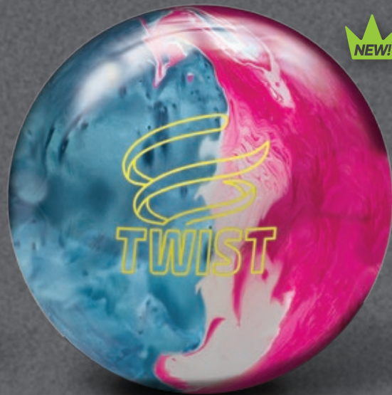
60-106064-93X Sky Blue/Pink/Snow