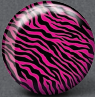
60-400617-93X Pink Zebra