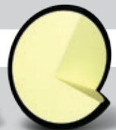
6, 8 lbs.