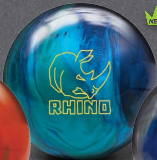
60-106037-93X Cobalt / Aqua / Teal Pearl