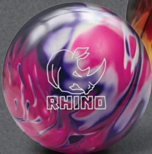
60-105811-93X Purple / Pink / White Pearl