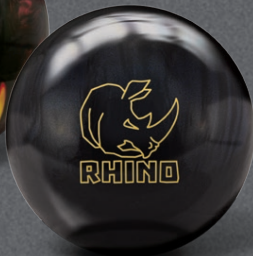
60-105809-93X Black Pearl