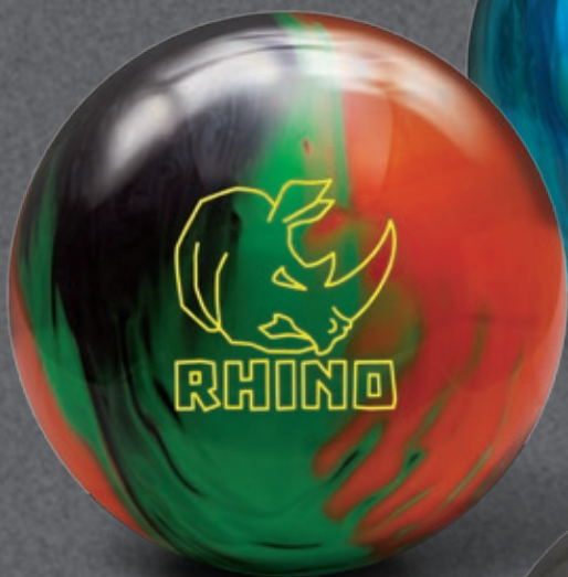
60-105910-93X Black / Green / Orange