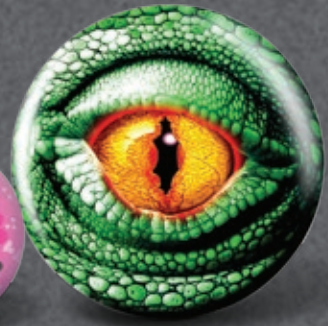
60-400528-93X Lizard Eye