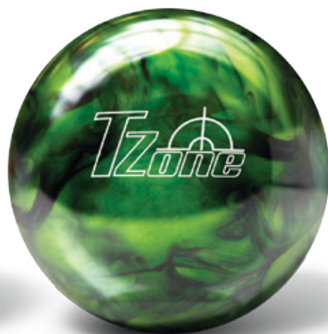
GREEN ENVY 60-105298-93X - Weights 6, 8-16