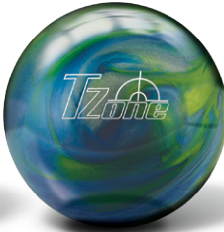
BLUE LAGOON 60-105527-93X - Weights 6, 8-16