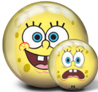
SPONGE BOB® YELLOW - NEW 60-400593-93X - U.S. only