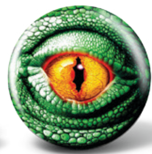
LIZARD EYE 60-400528-93X