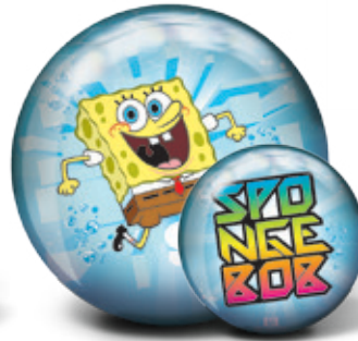
SPONGE BOB® BLUE - NEW 60-400594-93X - U.S. only