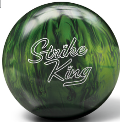
EMERALD PEARL - NEW 60-105632-93X