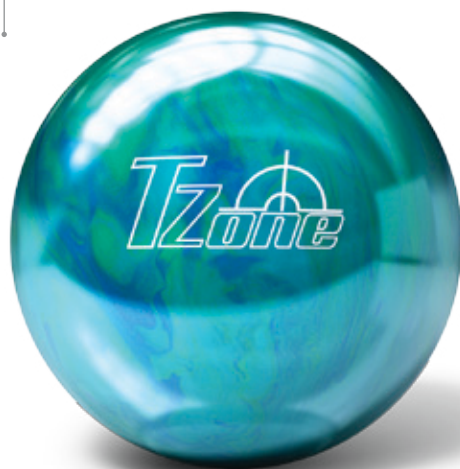
CARIBBEAN BLUE 60-105354-93X - Weights 6, 8-16