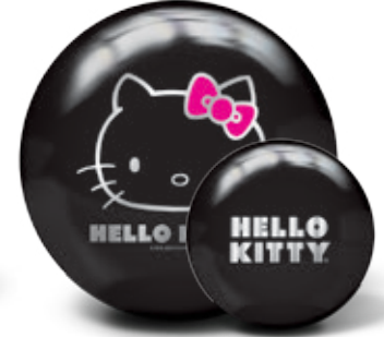
HELLO KITTY® BLACK 60-400590-93X - U.S., Canada & Mexico