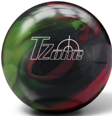
NORTHERN LIGHTS 60-105526-93X - Weights 6, 8-16