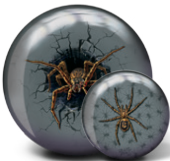
SPIDER - NEW 60-400596-93X