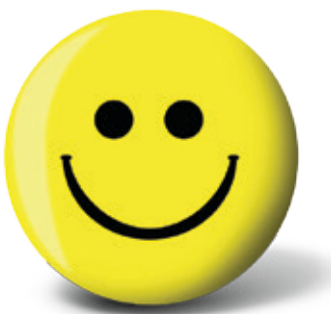
SMILEY FACE 60-400245-93X