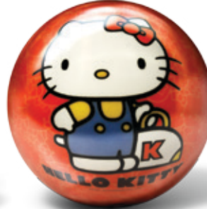
HELLO KITTY® 60-400557-93X - U.S., Canada & Mexico