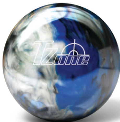
INDIGO SWIRL 60-105302-93X - Weights 6, 8-16