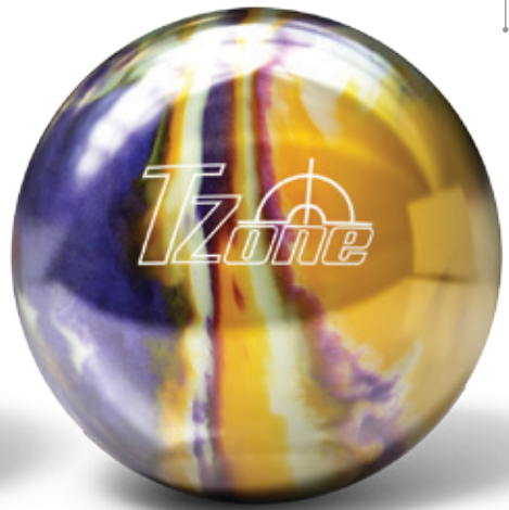
GROOVY GRAPE 60-105449-93X - Weights 6, 8-16