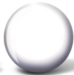
WHITE BALL 60-104221-93X