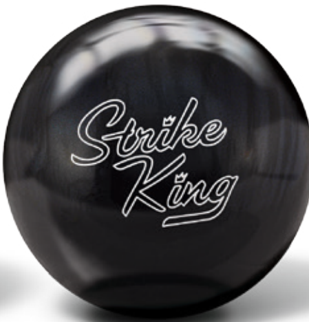
BLACK PEARL 60-105536-93X