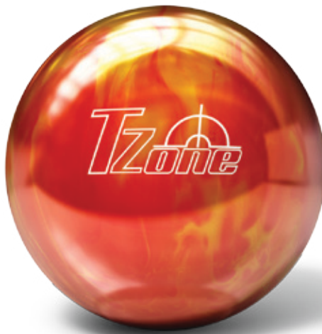
HOT LAVA 60-105447-93X - Weights 6, 8-16