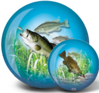
BASS FISHING 60-400582-93X