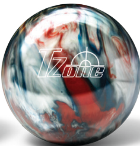
PATRIOT BLAZE 60-105300-93X - Weights 6, 8-16