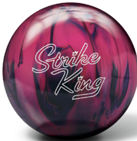
PURPLE/PINK PEARL 60-105539-93X