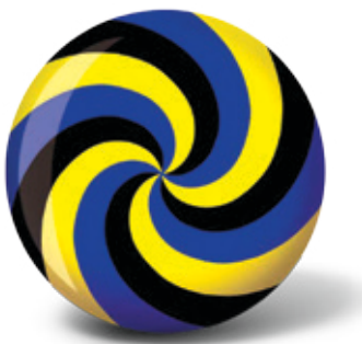
SPIRAL YELLOW/BLUE/BLACK 60-400575-93X