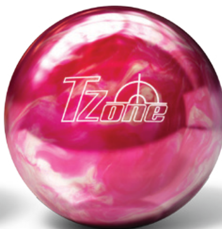
PINK BLISS 60-105299-93X - Weights 6, 8-14