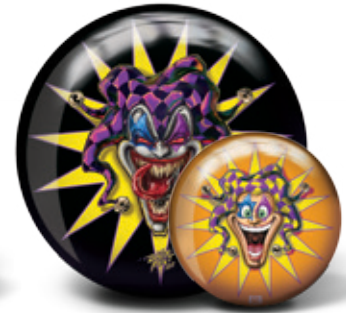
JOKER - NEW 60-400595-93X