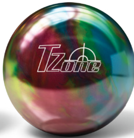
RAINBOW TWIST 60-105448-93X - Weights 6, 8-16