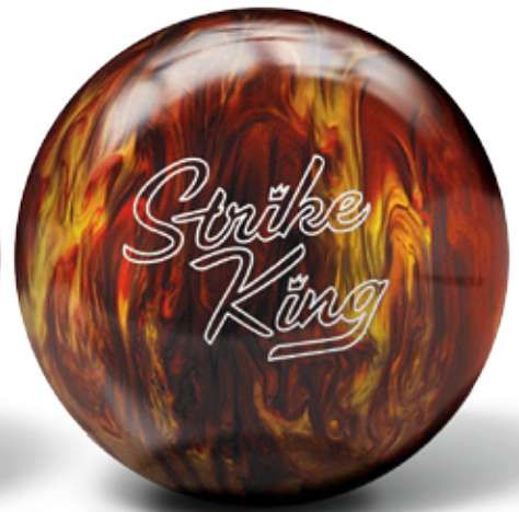
RED/GOLD PEARL 60-105538-93X