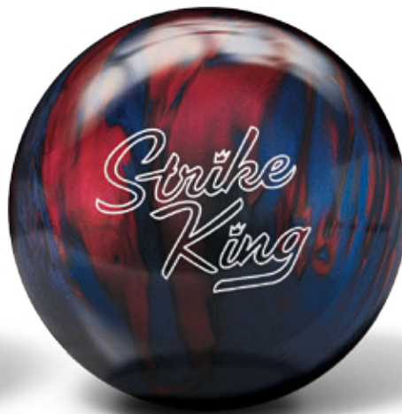
BLUE/RED PEARL 60-105540-93X