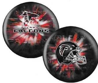
ATLANTA FALCONS / 6301R