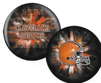
CLEVELAND BROWNS / 6307R