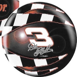
Dale Earnhardt, Sr. #3 / 4441

Introducing the NEW 2008 Dale Earnhardt Jr. #88 ball design!