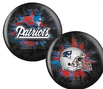
NEW ENGLAND PATRIOTS / 6318R