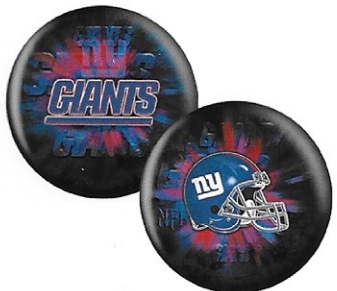
NEW YORK GIANTS / 6320R