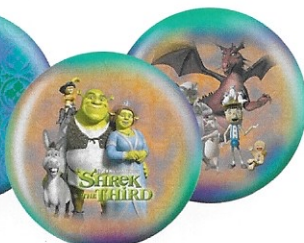
SHREK CAST / 6443