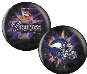
MINNESOTA VIKINGS / 6317R