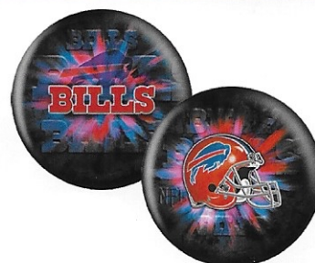
BUFFALO BILLS / 6303R