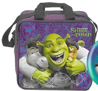
SHREK TOTE / 59-104204