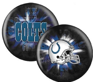
INDIANAPOLIS COLTS / 6313R