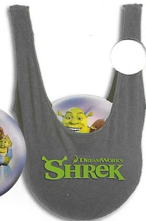
SHREK SEE SAW / 860307-SRK