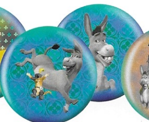
DONKEY / 6441