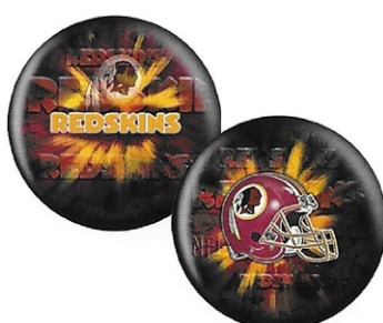
WASHINGTON REDSKINS / 6331R