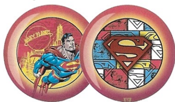
SUPERMAN MOSAIC / 21031R