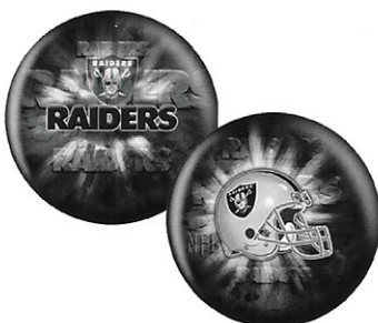
OAKLAND RAIDERS / 6322R