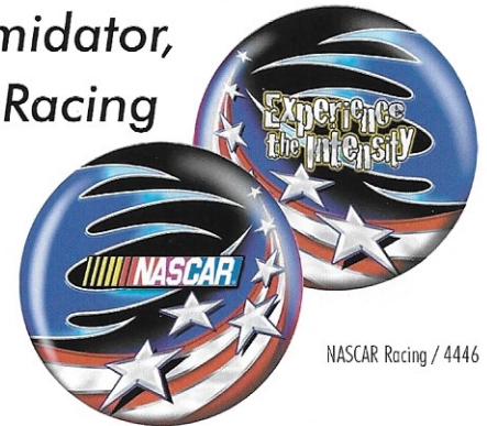
NASCAR Racing / 4446

Introducing the NEW 2008 Dale Earnhardt Jr. #88 ball design!