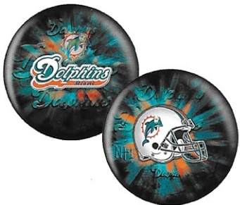
MIAMI DOLPHINS / 6316R