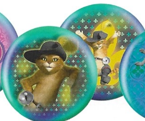
PUSS IN BOOTS / 6442