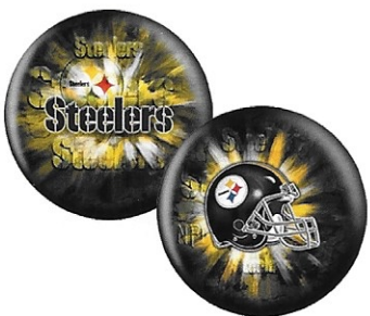
PITTSBURGH STEELERS / 6324R