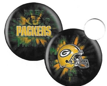
GREEN BAY PACKERS / 6311R