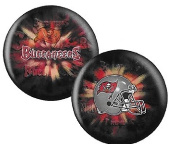
TAMPA BAY BUCCANEERS / 6329R