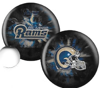
ST. LOUIS RAMS / 6328R