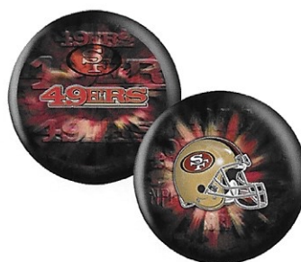
SAN FRANCISCO 49ERS / 6326R