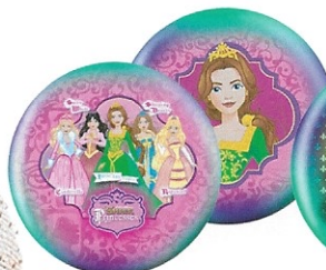
PRINCESSES / 6444