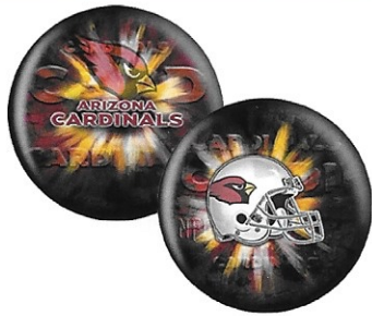
ARIZONA CARDINALS / 6300R