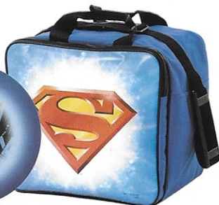
SUPERMAN TOTE BAG / 59-104201