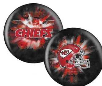
KANSAS CITY CHIEFS / 6315R