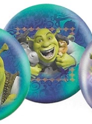
SHREK BABIES BALL / 6493