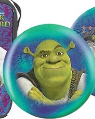
SHREK BALL / 6440