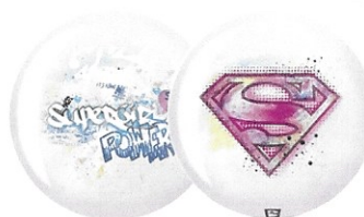
SUPERGIRL / 21033R

Quantities in some styles/weights are limited and are subject to availability.