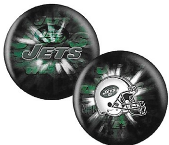
NEW YORK JETS / 6321R