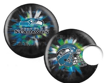
SEATTLE SEAHAWKS / 6327R

NFL team balls are available in weights of 8, 10, 12, 14, 15 & 16 lbs. (each is shown here in front and back view). Selected teams are also available in single ball tote bags, single, double and triple roller bags, plus bowling towels featuring all 32 teams.