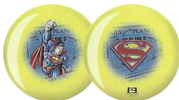
SUPERMAN DAILY PLANET / 21032R