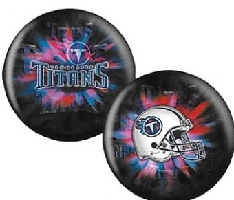
TENNESSEE TITANS / 6330R