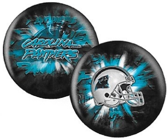
CAROLINA PANTHERS / 6304R