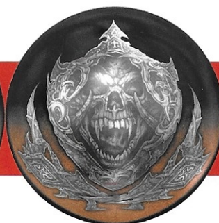
Dale Earnhardt, Jr. #88 / 4447