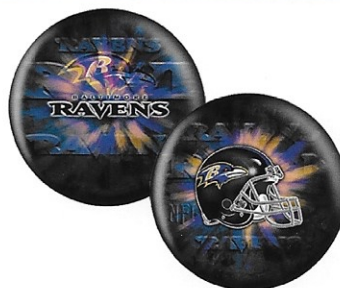
BALTIMORE RAVENS / 6302R