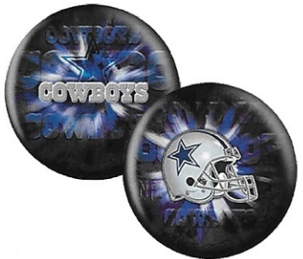
DALLAS COWBOYS / 6308R