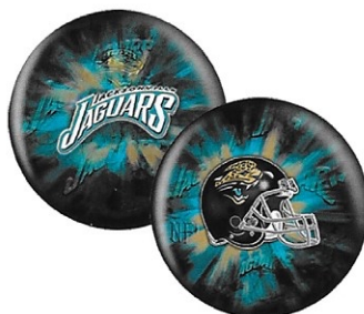
JACKSONVILLE JAGUARS / 6314R