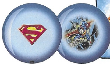
SUPERMAN CLASSIC SHIELD / 21030R

The Superman™ collection includes four Viz-A-Balls® all available in weights of 6, 8, 10, 12, 14 & 15 lbs. (each is shown below in front and back view) plus a classic design single ball tote bag.