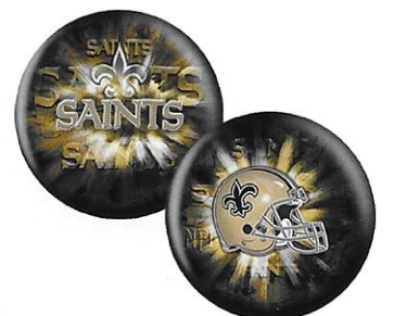
NEW ORLEANS SAINTS / 6319R