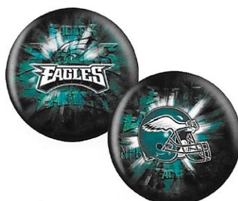
PHILADELPHIA EAGLES / 6323R