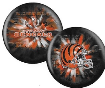
CINCINNATI BENGALS / 6306R