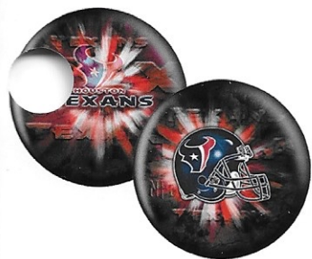
HOUSTON TEXANS / 6312R