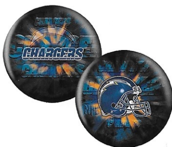
SAN DIEGO CHARGERS / 6325R