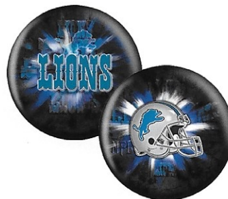
DETROIT LIONS / 6310R