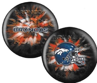
DENVER BRONCOS / 6309R