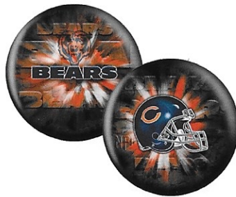
CHICAGO BEARS / 6305R