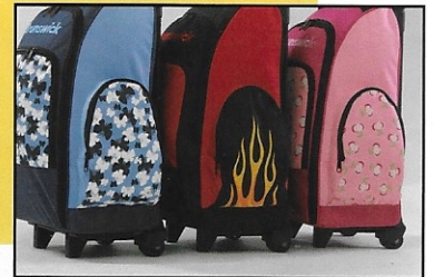
Side pocket detail