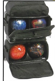
Convenient front loading compartments