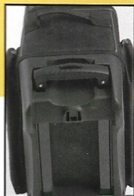
Flush mount handle