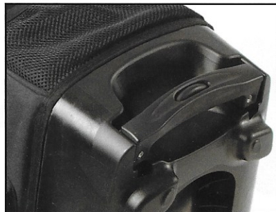
Flush mount handle