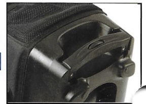
Flush mount handle