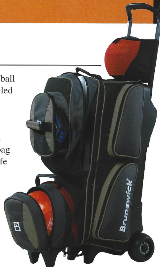
PPO 345 shown