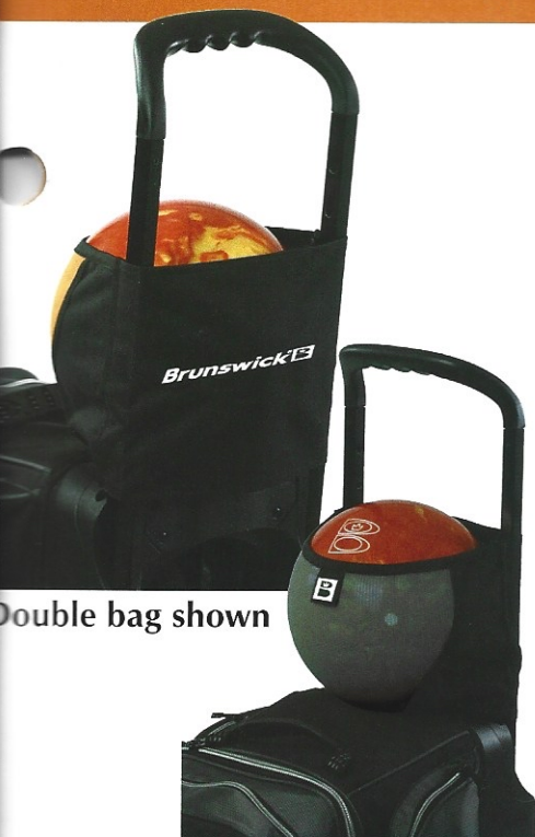
Double bag shown