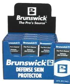
Defense™ Skin Protector