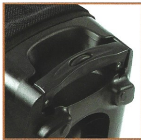
Flush Mount Handle