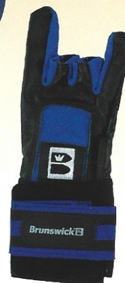
Power XXX Glove