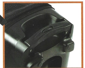
Flush Mount Handle