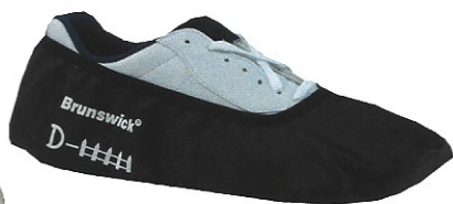
Defense™ Shoe Cover