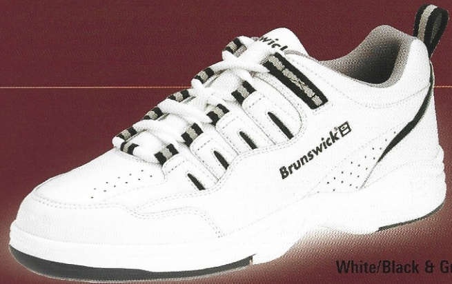
White/Black & Grey Trim