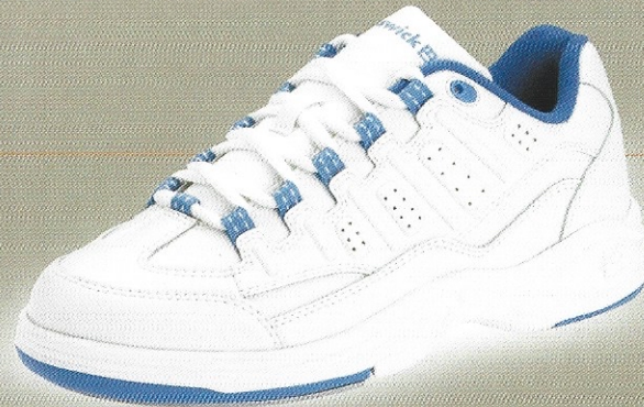
White/Power Blue Trim