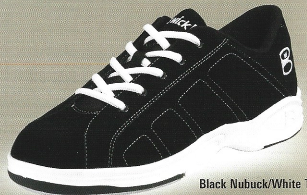
Black Nubuck/White Trim