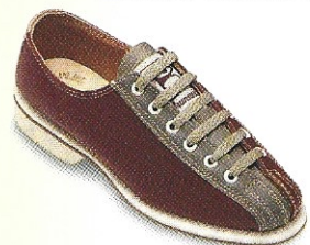
WOMEN'S RENTAL SHOE 58-109100