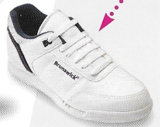
CYCLONE Wide-White/Navy; 58-109406