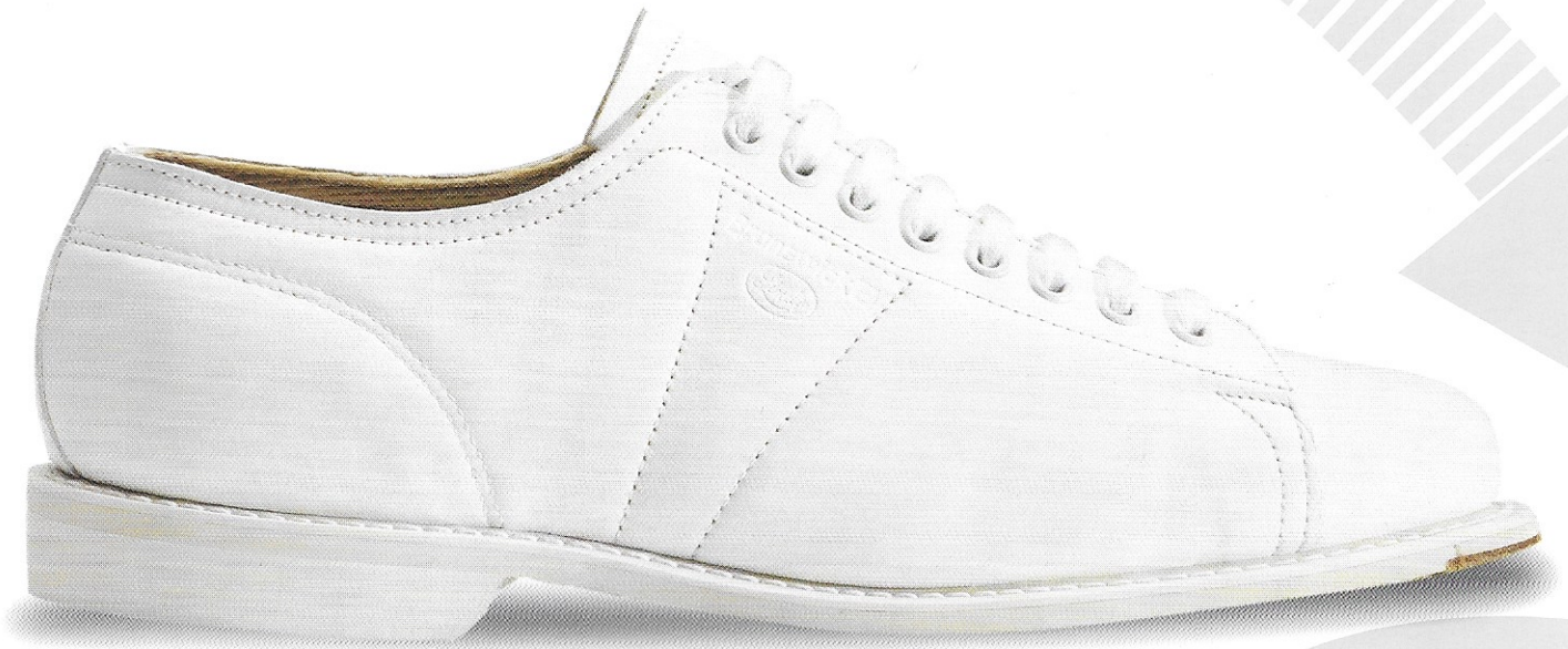
BRUNSWICK PRO BY LINDS (right hand only) White; 58-109176

Some of bowling's most advanced technology belongs at the bottom of your game. Lace up Brunswick's cutting-edge, cushioned, comfortable and consistent athletic shoes. All shoes come in sizes 7-12 and 13 unless otherwise indicated.