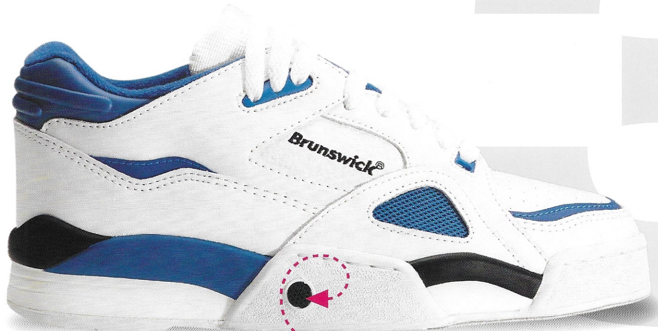
BULLIT White/Blue/Black; 58-109213

The real Pro. Get Linds quality backed by Brunswick performance, with a Buckskin Slide Sole, a Goodyear welt, a spring, steel-shank arch support and Cambrelle lining.