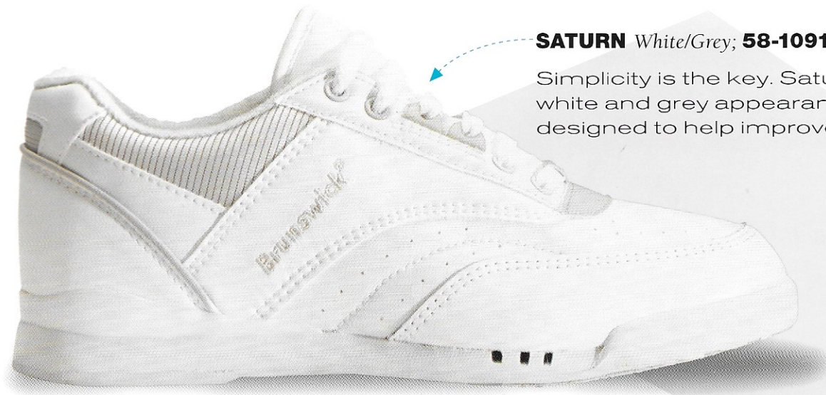
SATURN White/Grey; 58-109188

Simplicity is the key. Saturn's simple white and grey appearance is simply designed to help improve your delivery.