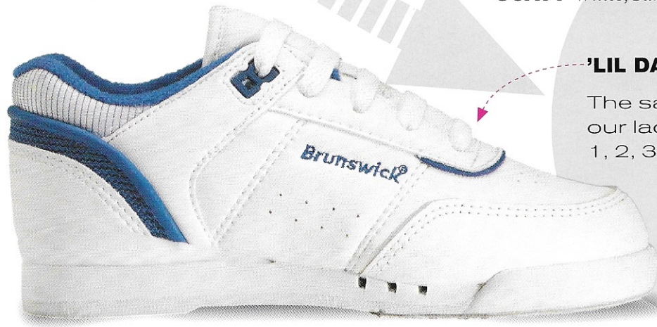
SCATT White, Canvas; 58-109217