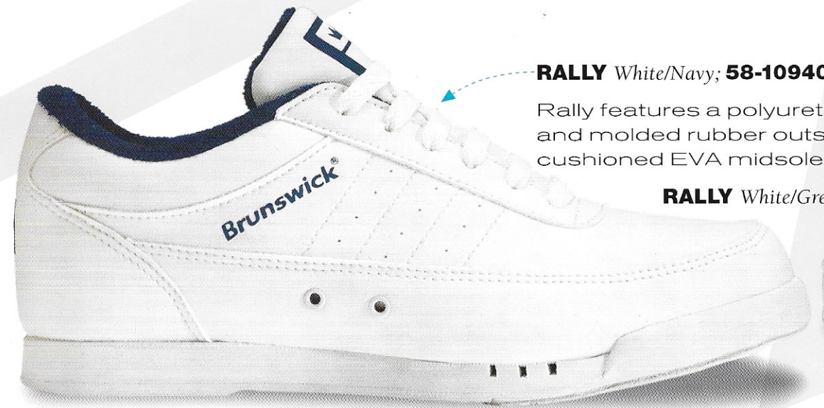
RALLY White/Navy; 58-109402

Rally features a polyurethane upper and molded rubber outsole, with a cushioned EVA midsole.