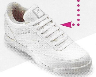
RALLY White/Grey; 58-109401

Rally features a polyurethane upper and molded rubber outsole, with a cushioned EVA midsole.