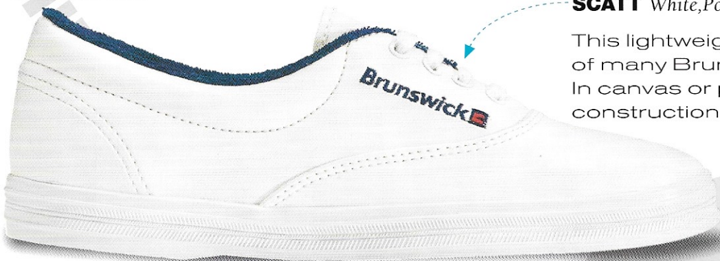
SCATT White, Polyurethane; 58-109405

This lightweight tennie is a favorite of many Brunswick bowlers. In canvas or polyurethane construction. Sizes 5-9 and 10.