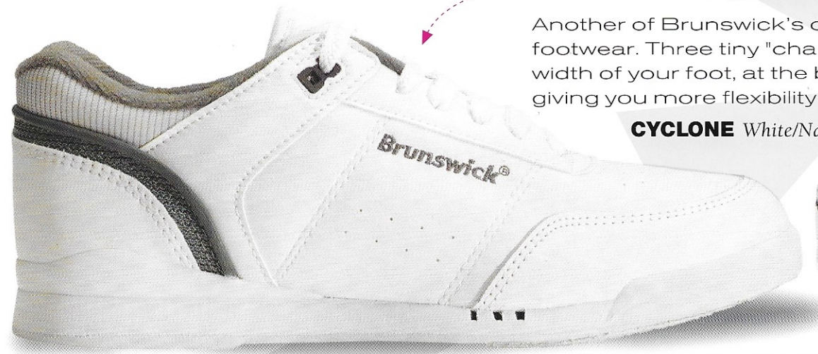
CYCLONE White/Grey; 58-109179

Simplicity is the key. Saturn's simple white and grey appearance is simply designed to help improve your delivery.