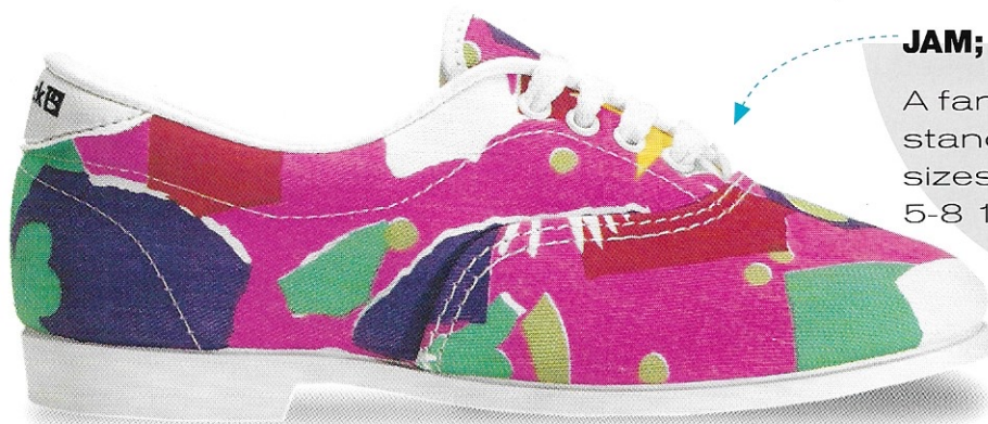
JAM ; 58-109216

The same style and sturdiness of our ladies Dart, shrunk to kid sizes: 1, 2, 3, 4, and 4 1/2.