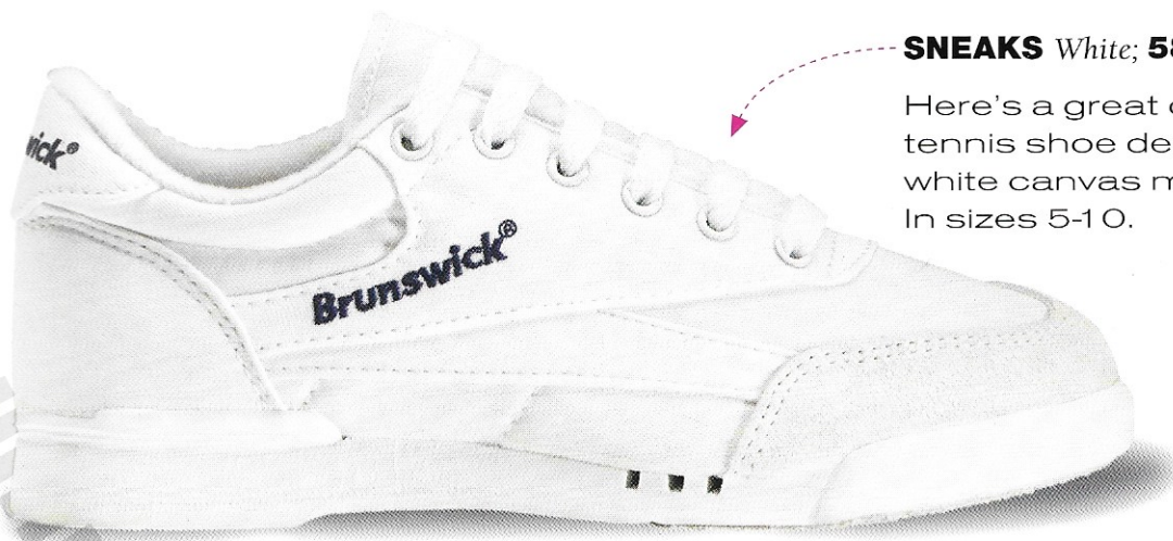
SNEAKS White; 58-109195

Here's a great combination: a tennis shoe design constructed in white canvas material. Sneaky. In sizes 5-10.