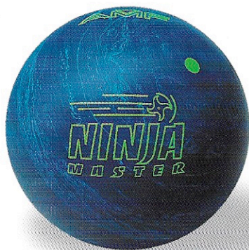
The new Ninja Master.