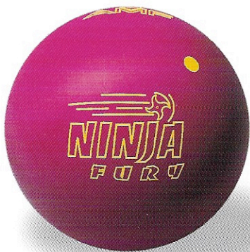
The new Ninja Fury.

On one end of the spectrum, the new Ninja Master—even-arc-ing, highly controllable, and an excellent choice for medium to heavy oil and wet-dry lane conditions.