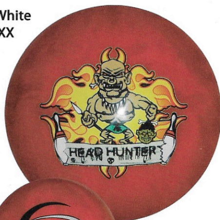
Head Hunter 1405-48-XX