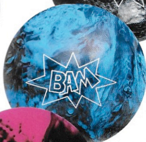
Bam Blue/Black 1404-10-XX