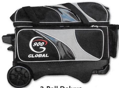
2-Ball Deluxe GB05-02-14