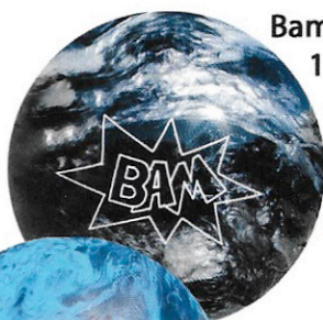
Bam Black/White 1404-02-XX