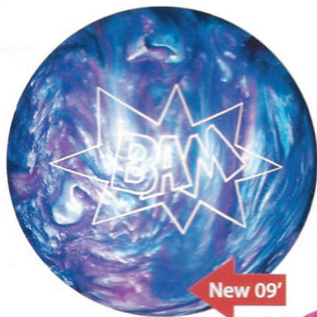
Bam Blue/Purple/White 1404-51-XX