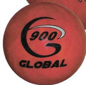
Head Hunter Spare Ball available (12, 14 -16 LB.)