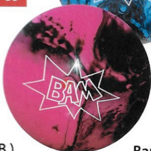
Bam Black/Pink 1404-48-XX