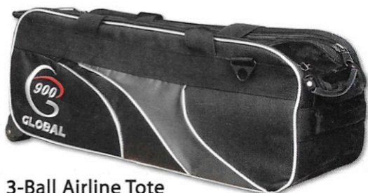
3-Ball Airline Tote GB06-02-13