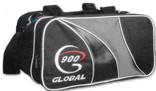
2-Ball Tote GB04-02-14