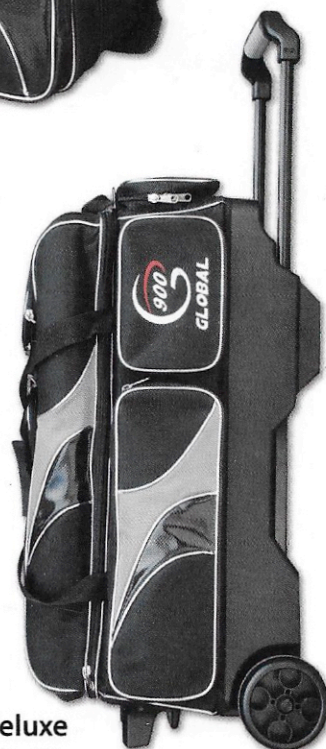
3-Ball Deluxe GB07-02-12