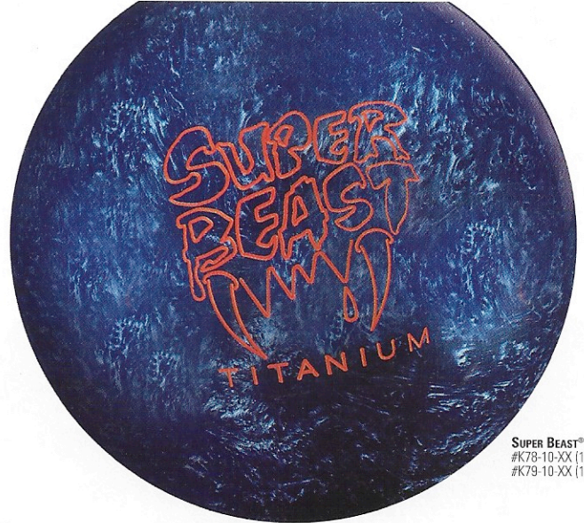
SUPER BEAST® TITANIUM #K78-10-XX (12-16 LBS.) #K79-10-XX (10-11 LBS.)