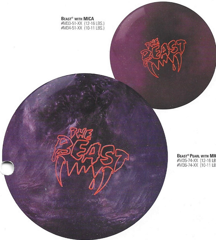
BEAST® WITH MICA #M33-51-XX (12-16 LBS.) #M34-51-XX (10-11 LBS.)