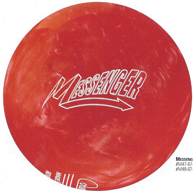
MESSENGER™ PEARL #M47-67-XX (12-16 LBS.) #M48-67-XX (10-11 LBS.)