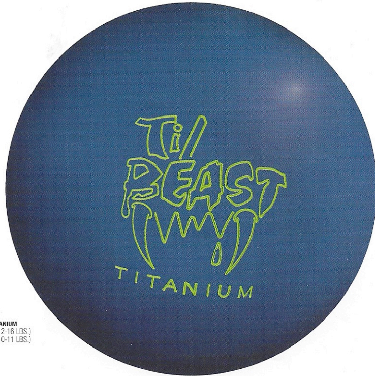
Ti/BEAST® TITANIUM #L09-10-XX (12-16 LBS.) #L10-10-XX (10-11 LBS.)