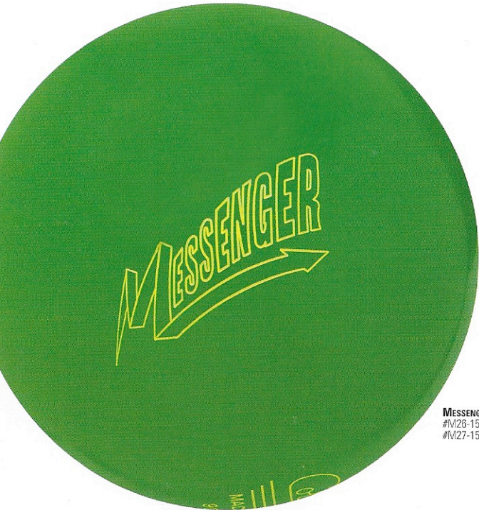
MESSENGER™ #M26-15-XX (12-16 LBS.) #M27-15-XX (10-11 LBS.)