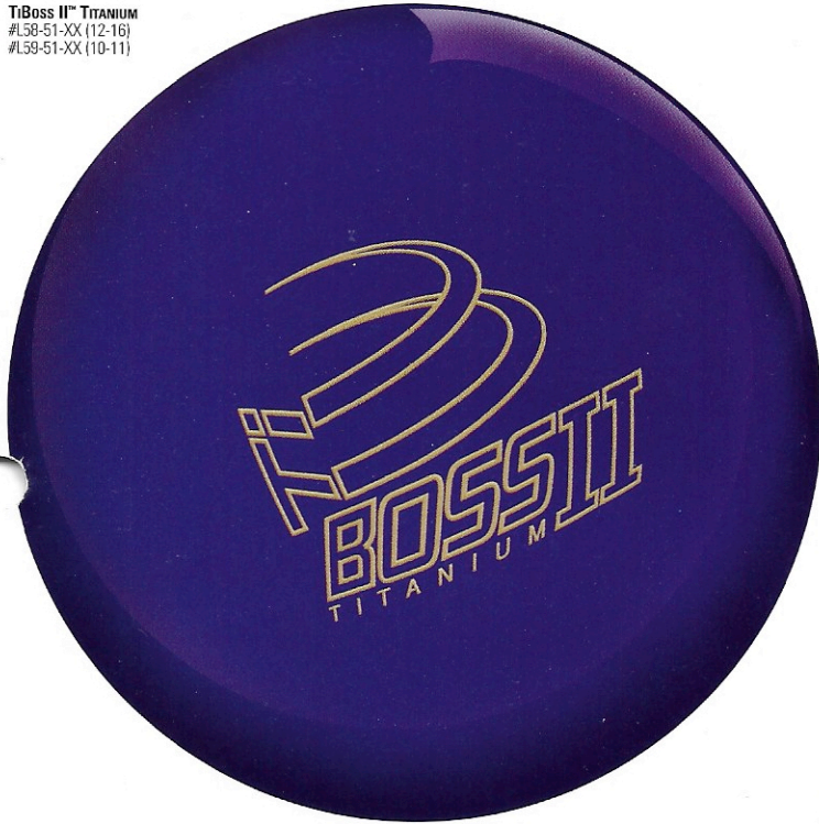
TiBoss II™ TITANIUM #L58-51-XX (12-16) #L59-51-XX (10-11)