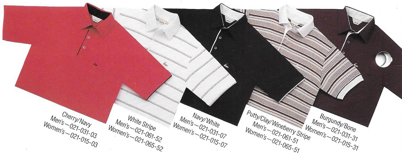
Cherry/Navy Men's—021-031-03 Women's—021-015-03

The Angle Line: Bold stripes or traditional solids in a 65% polyester/35% cotton blend. Knit collars on stripe shirts (except white) and fancy collars on solid shirts. 6" continental plackets. Contrasting collar and sleeve trim on solid shirts. Distinctive Angle logo on breast pocket. Extra long tail on Men's model. Men's solid sizes: S, M, L, XL & XXL. Men's stripe sizes: S, M, L & XL. Women's solid and stripe sizes: S, M, L & Q.