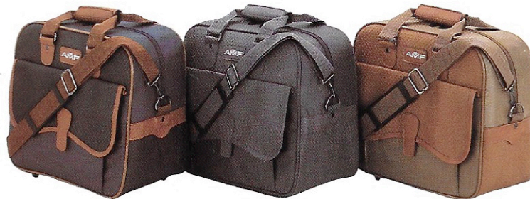
Forest Green 035-012-411

Saddle Bag: Grained Oxford vinyl in a contemporary design. Outside accessory storage pockets with velcro closure flap. Roomy inside for ball, shoe and accessory storage. Leather-look "Primo" trim and adjustable shoulder strap. Wrapped reinforced handles.