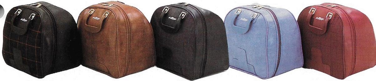
Black Plaid 035-007-904