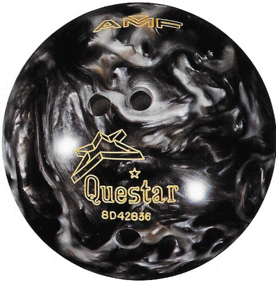
Questar Charcoal 12, 14, 15 & 16 lbs. 033-0054