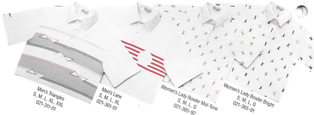
Men's Triangles S, M, L, XL, XXL 021-311-01

Men's Premiere: 60% cotton/40% polyester for easy care. Always looks smart. 6" continental placket with coordinated AMF buttons. Fancy, reinforced collar. Extra long shirt tail. Distinctive AMF sleeve logo.