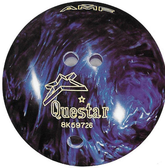
Questar Blue 6, 8, 10, 12, 14, 15 & 16 lbs. 033-0052