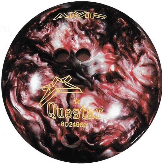
Questar Red 6, 8, 10 & 12 lbs. 033-0053