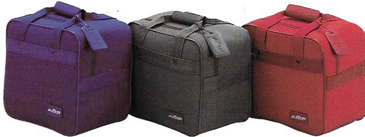
Royal Blue 035-012-432

Divider: Oxford vinyl body. Full zippered side drop for easy ball access. Molded color coordinated carry handles. Stylish grained vinyl or plaid front panels provide traditional styling with flair.