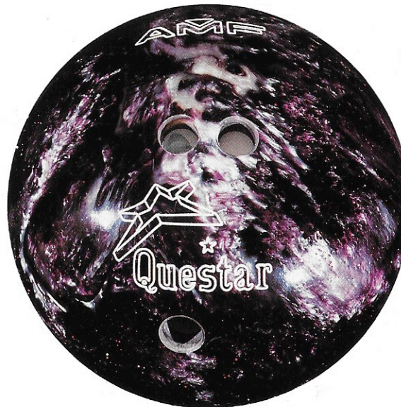
Questar Purple Metallic 10, 12, 14, 15 & 16 lbs. 033-0056