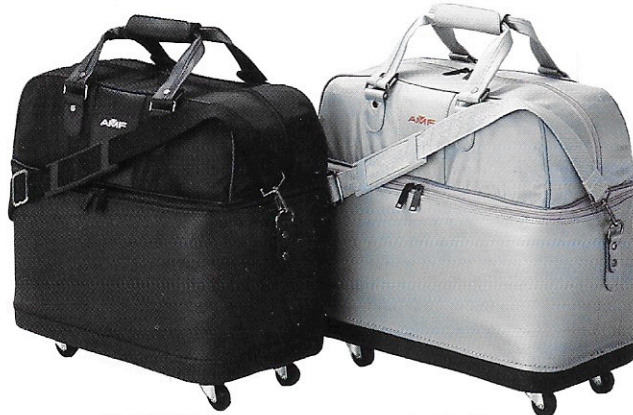
Midnight Black 035-012-461

Superbag: Scuff-proof body of 420 Denure nylon laminated with P.V.C. on 100% polyester backing. Crush-proof polypropylene support frame. Rugged molded bottom with four affixed wheels. Separate zippered shoe compartment. Roomy 2900 cubic inches of storage space. Removable ball cups. Dual slide nylon zippers. Two popular colors.