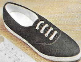
109-47 Black Corduroy, R.H.