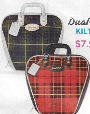
103-33 MacPerson red 103-34 MacArthur green