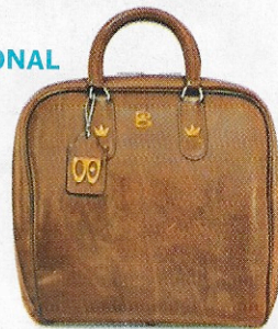
103-73 London Brown