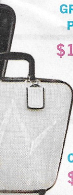
103-84 White 103-91 Charcoal 103-96 Chestnut