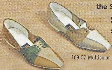
109-57 Multicolor Crush Grain, R.H.