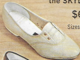
109-51 Bone, R.H.