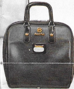
103-84 White 103-91 Charcoal 103-96 Chestnut