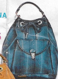
103-24 Sapphire Blue