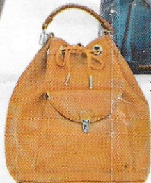
103-25 Ranch Tan