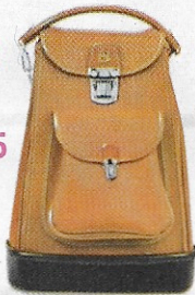
103-72 Ranch Tan