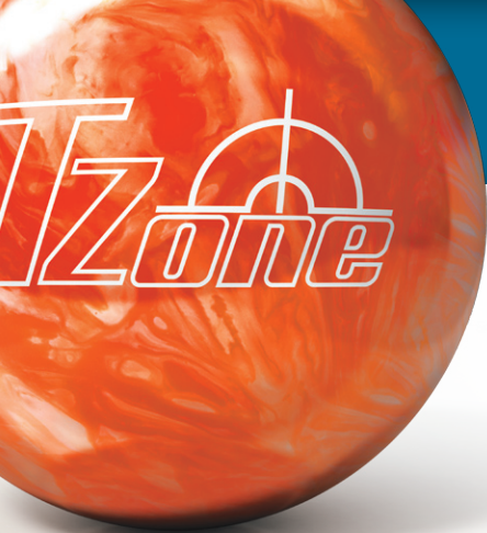
Orange/White Pearl Glow