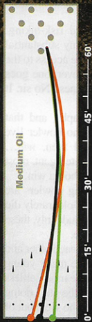
TWEENER STROKER CRANKER

The Diablo™ has unleashed a sinister new weapon for the new STORM® Fire Line™ . Within the depths of its Reactor™ solid reactive coverstock lies the powerful Twin-V™ weightblock that produces a soul crushing reaction.