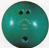
First polyester bowling ball manufactured in San Antonio, Texas 1960.

Our twentieth year . . . You still can search the world over and not find a better ball!