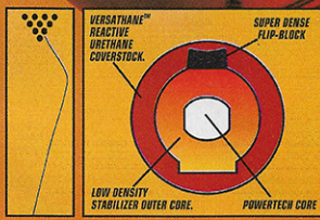
CODE RED™ POWERTECH CORE™